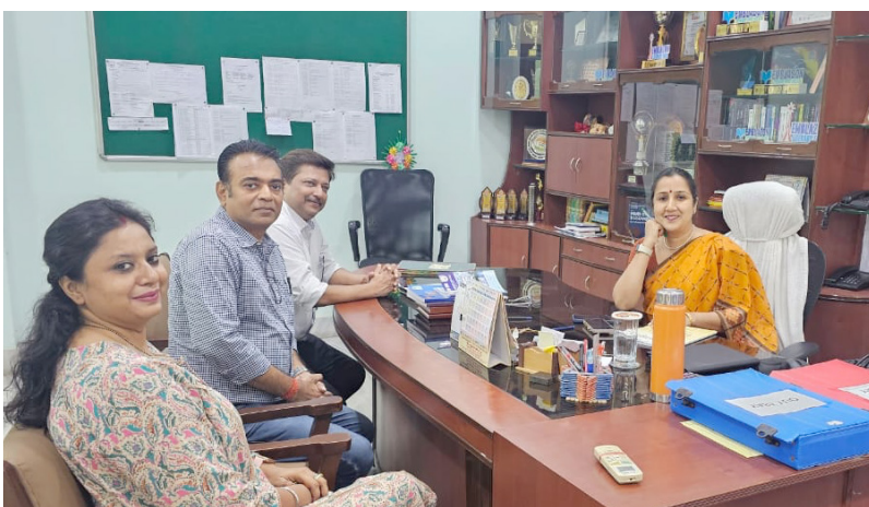
First Meeting with the Principal of our newly formed Interact Club - Salt Lake Shiksha Niketan on 22 nd August, 2025.